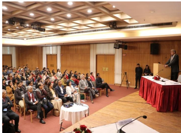
Glimpses of Education Summit