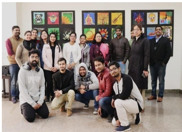
Exhibition of Murals- Photograph 1