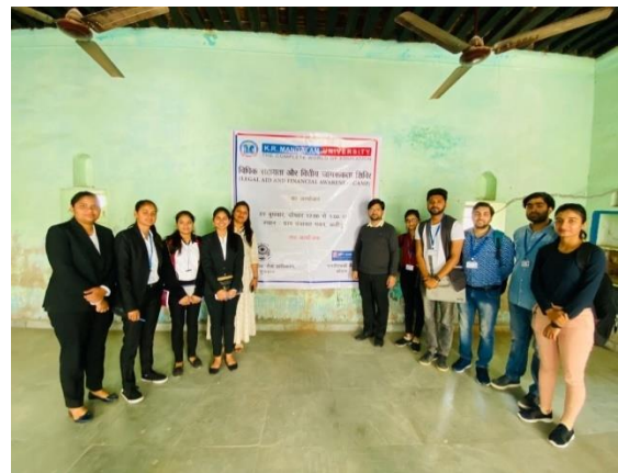
Legal and Financial Awareness Camp