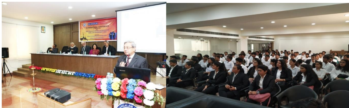
International Conference on “Spectrum of Opportunities in 2020- Management and Legal Era” on 6 th and 7 th Feb 2020.