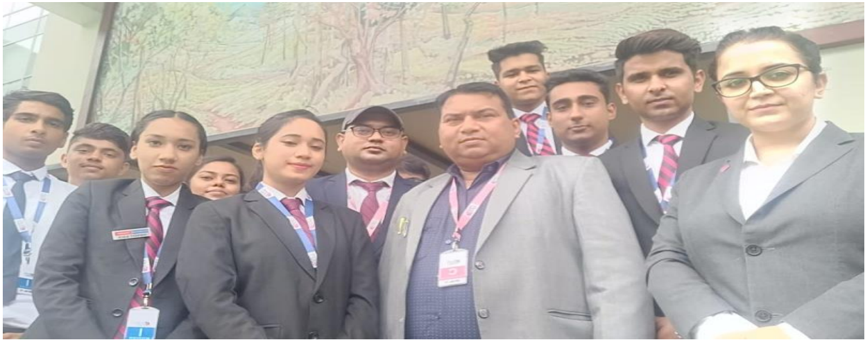
Visit to Hotel ALOFT by Marriott International Aerocity N Delhi