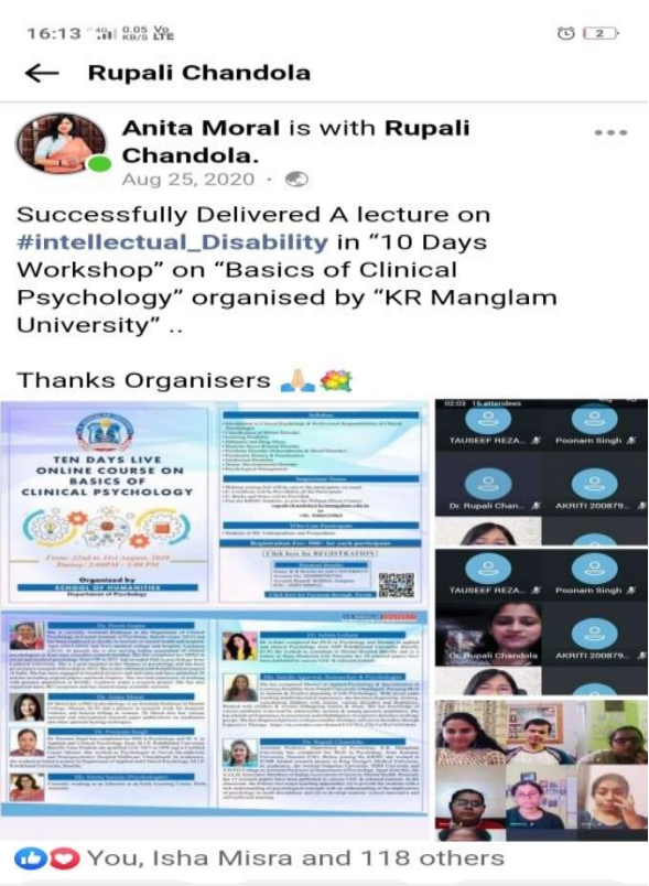
Glimpses of Activities Conducted by the School of Humanities