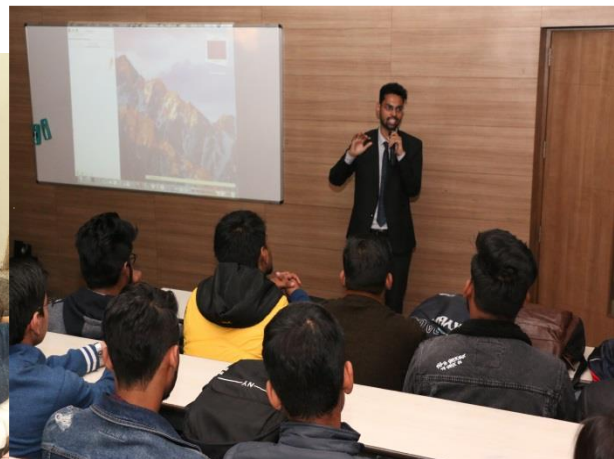
Students performing during various activities