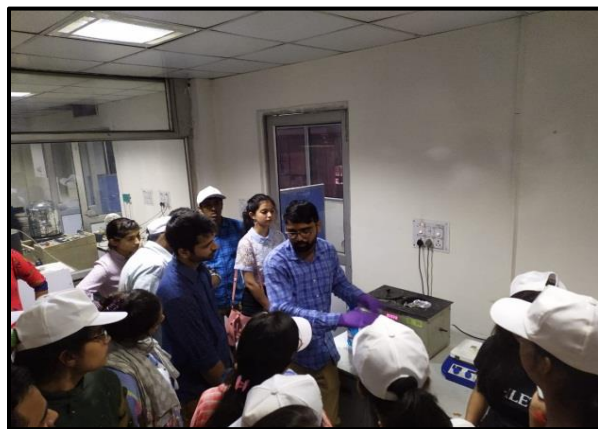
Kron Mar College, DE