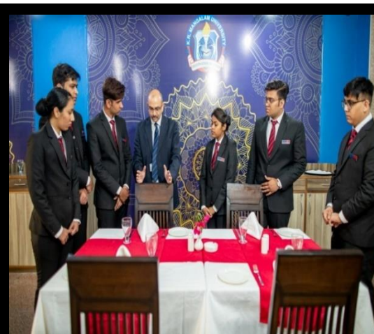
Students are in action at various Hotel Management Labs