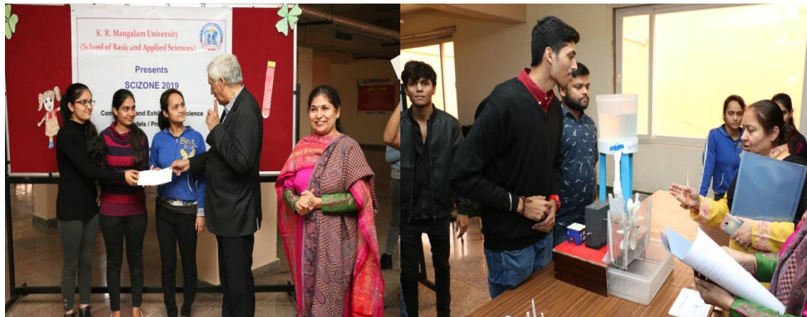
Glimpses of SCIZONE - Spectacle of Science