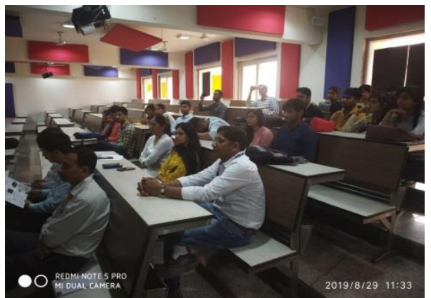
Glimpses of Activities Conducted by the School of Medical and Allied Sciences