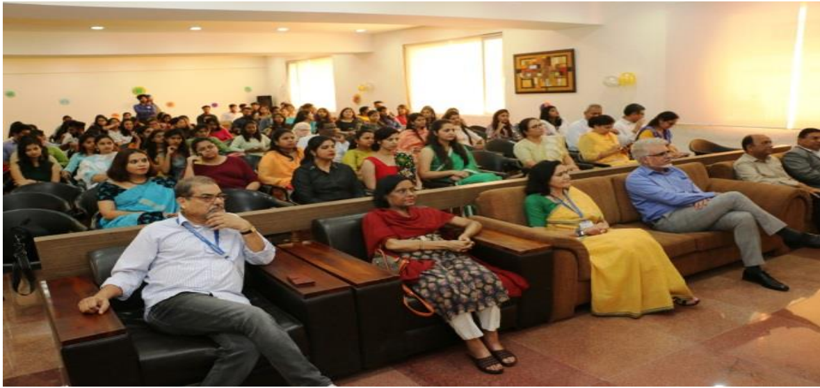
Awareness Session on NAAC on March 14, 2020