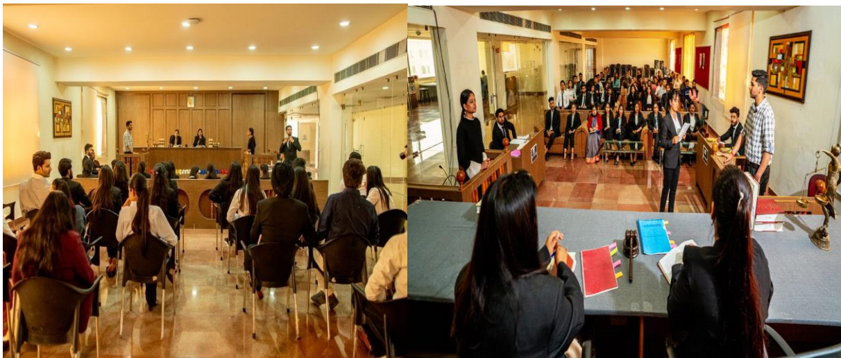
Moot Court Competition