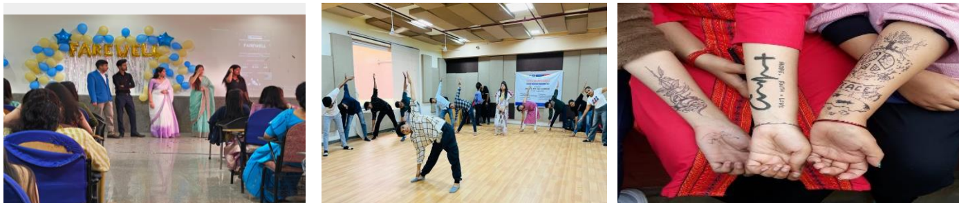
Students of SBAS participating in Extracurricular activities

The educational philosophy of the School of Basic and Applied Sciences is built on fostering intellectual curiosity, critical thinking, and the practical application of scientific knowledge. Emphasizing a student-centric approach, SBAS integrates foundational science with real-world challenges, preparing students for leadership roles in both academia and industry. Through collaborations with national and international institutions, research organizations, and industries, the school provides cutting-edge resources and hands-on experiences that bridge the gap between theory and practice. SBAS is committed to empowering students with technical expertise while instilling ethical values, social responsibility, and a lifelong commitment to learning. The aim is to nurture well-rounded, innovative, and responsible individuals ready to contribute to scientific advancement and societal betterment.