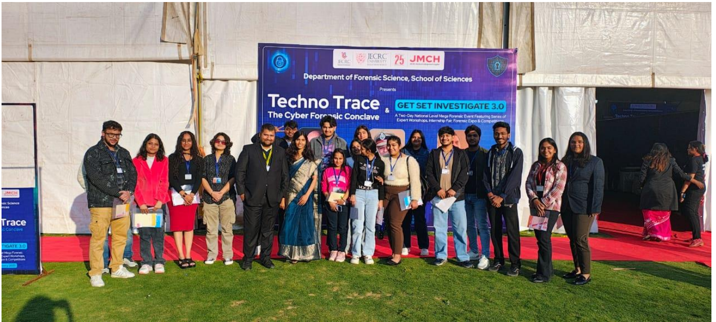
Educational Visit to JECRC University, Jaipur on 24-25 January 2025

K.R. MANGALAM UNIVERSITY THE COMPLETE WORLD OF EDUCATION