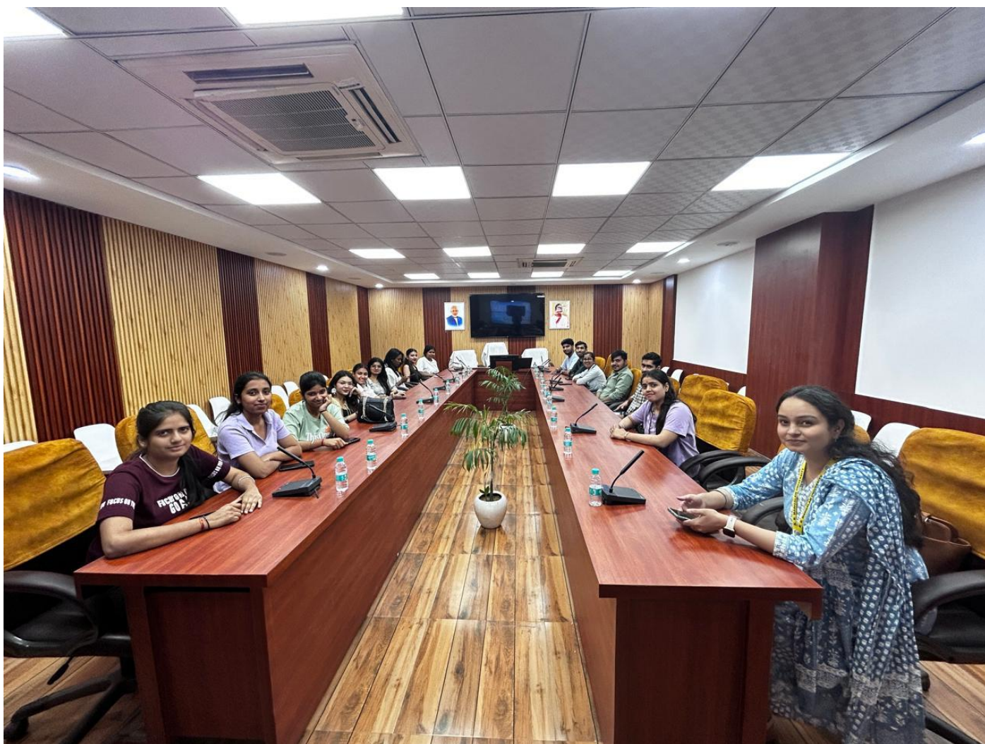
A visit to Indian institute of Packaging on 3 April 2025