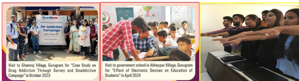
Students taking oath to preserve environment on June 5, 2018.