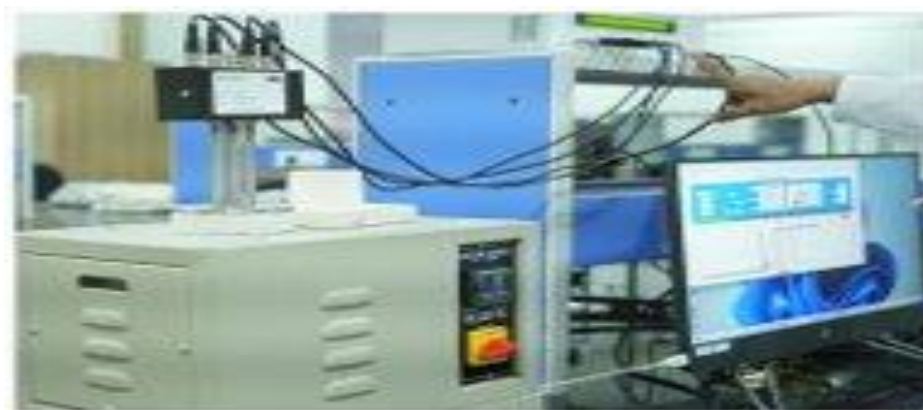
Central Instrumentation Research Facility in SBAS.

CIF supports interdisciplinary research, allowing users to conduct in-depth experiments and gather critical data for their projects. By fostering a collaborative environment and offering top-tier resources, the CIF plays a vital role in enhancing the research capabilities of the school, contributing to scientific advancements and innovation.