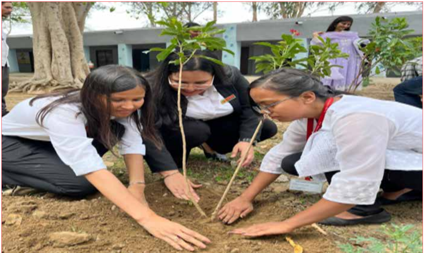
Students planting hope for a sustainable future.