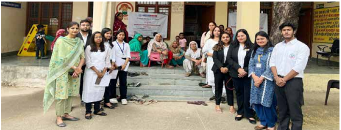
Awareness Camp on Environmental Law and Safeguards by SOLS Students

in ensuring sustainable development. She emphasized the need for legal awareness as a powerful tool to protect natural resources and uphold environmental rights. The interactive nature of the camp encouraged active participation, with attendees engaging in discussions and queries on pressing environmental issues. The event proved to be an enriching experience, inspiring students and participants to contribute towards environmental conservation through legal knowledge and awareness.