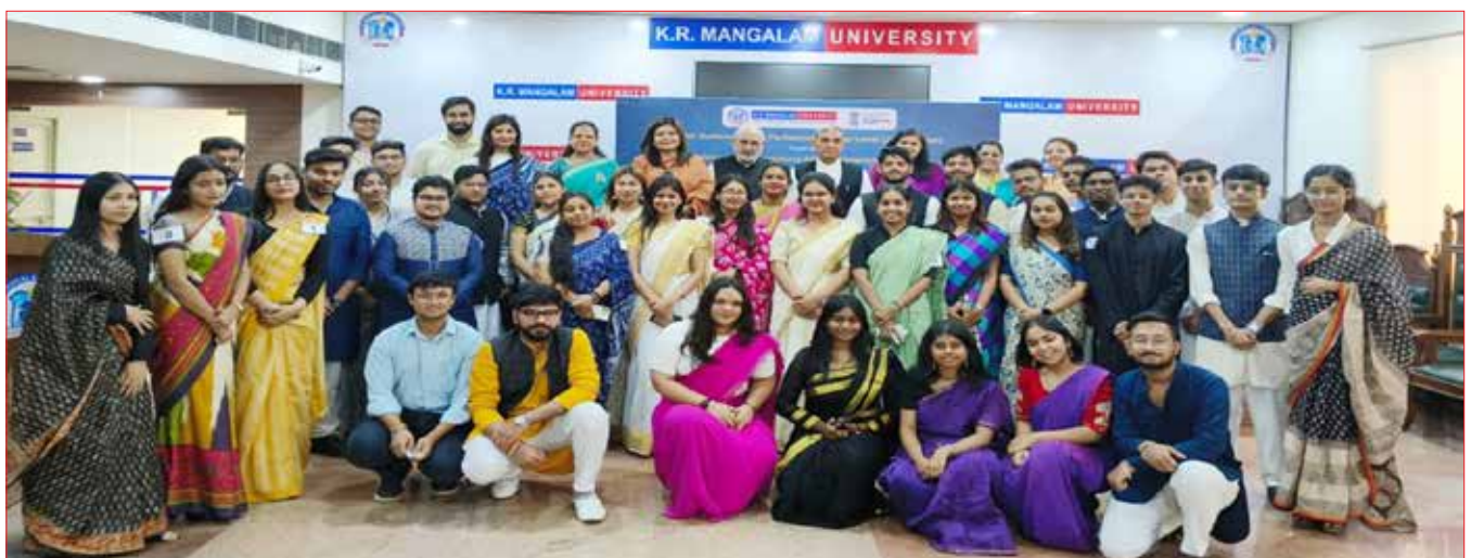
Students showcasing the spirit of democracy at the 17th National Youth Parliament Competition, Group Level, held at K.R. Mangalam University on April 29, 2025

17th National Youth Parliament Competition (Group Level) on April 29, 2025, under the aegis of the Ministry of Parliamentary Affairs, Government of India