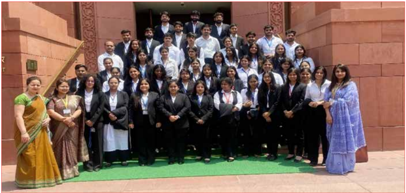
Students with Faculty in Parliament Visit on 17 April 2025.