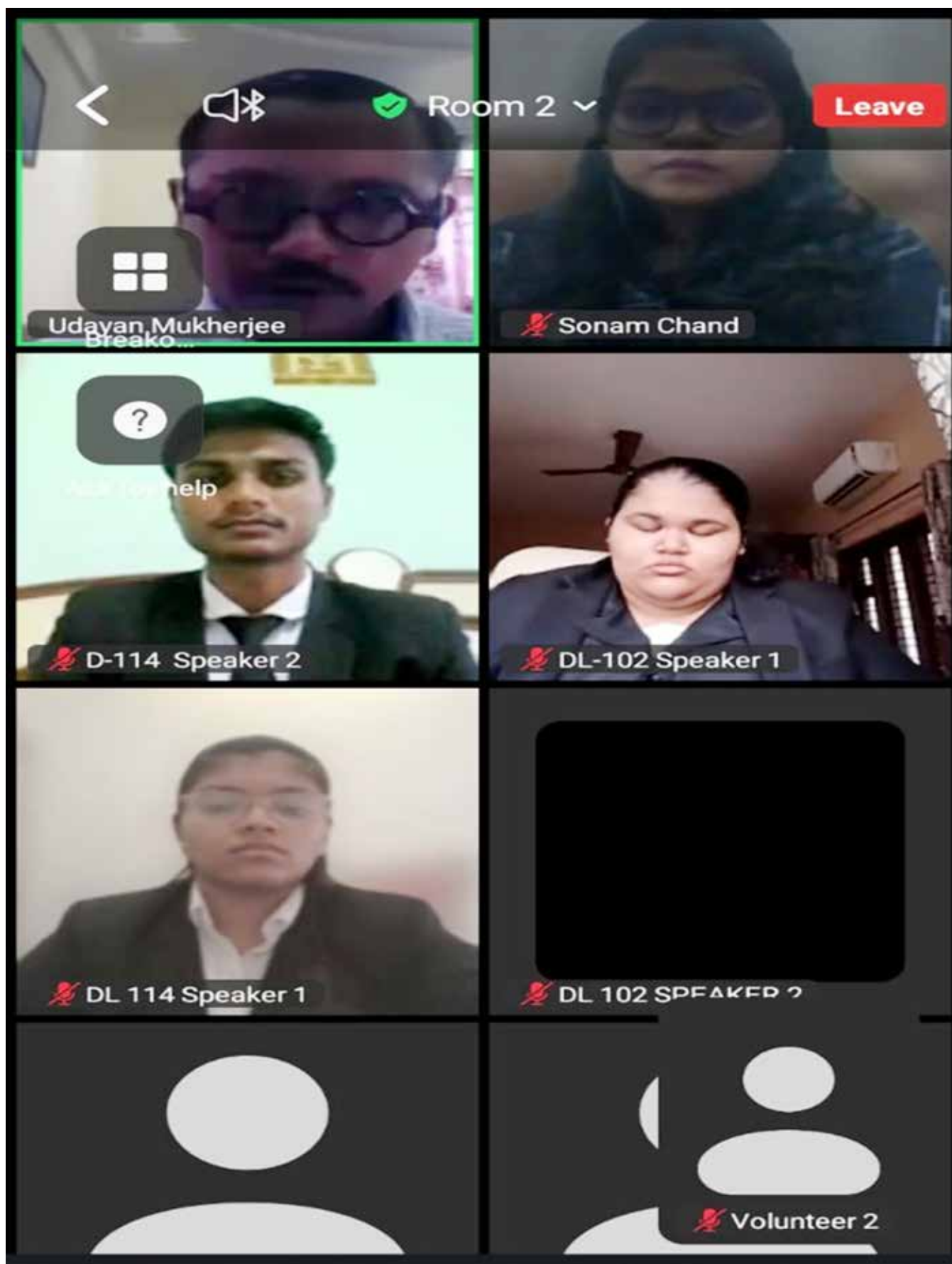
Students participating in Inter-University Moot Court Competition.