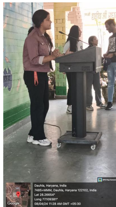
NSS volunteers explained the harmful impact of wastewater on health of human being