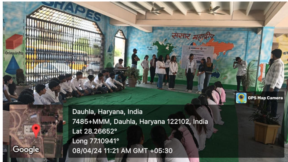
NSS volunteers during their skit performance

transmitted through wastewater, including cholera, typhoid fever, hepatitis, and gastroenteritis. They also learned about the symptoms, preventive measures, and the importance of early intervention in mitigating these health risks.