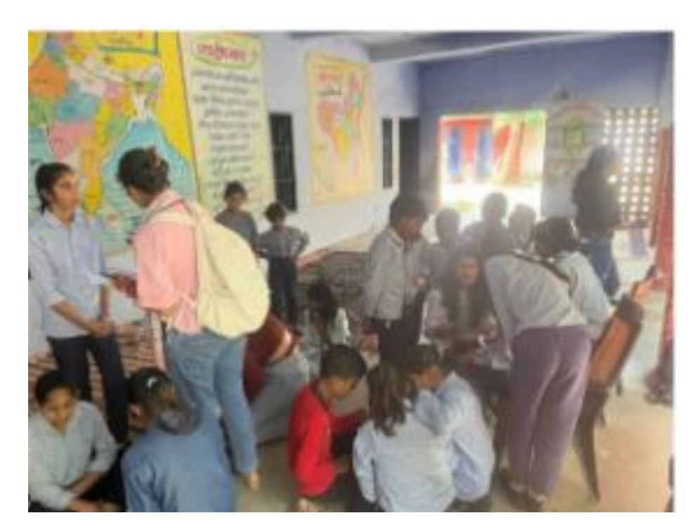
Lecture On Gender Sensitisation